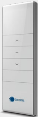
1 CHANNEL Remote