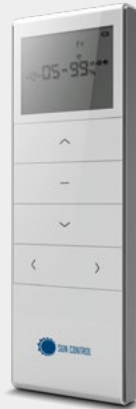
5 CHANNEL Remote with Timer